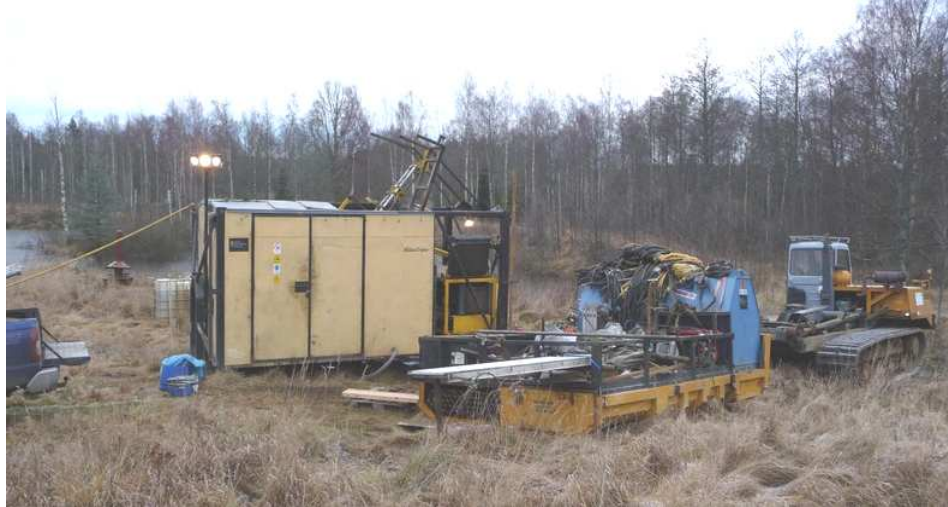
Drilling at Norra Kärr, Southwest Sweden, December 2009

Tasman holds two claims via joint venture at Bastnäs in central Sweden and can earn 90% of the property with easy terms. There is a 2% NSR buyable for less than $1 million if the partner chooses not to participate.