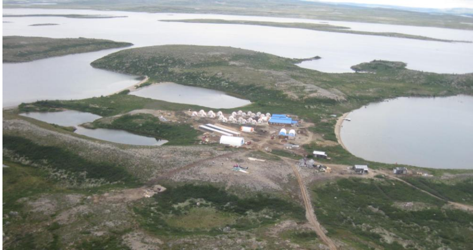
Bird's-eye View of the Strange Lake Camp in August 2011