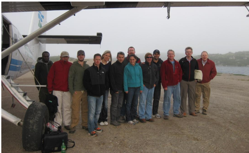
2011 Tour of Analysts, Geologists, and Company Personnel