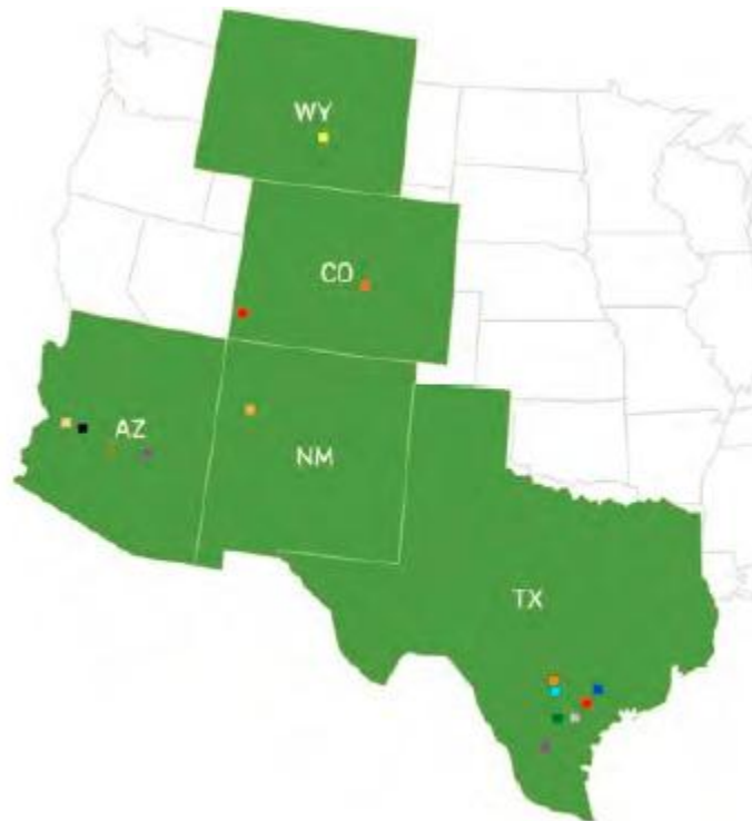
UEC's Exploration Properties in the Western United States

In addition to its South Texas assets, Uranium Energy holds 17 uranium properties in various stages of exploration in the States of Arizona, Colorado, New Mexico, Texas and Wyoming. Most are located in historical uranium mining areas and have been explored by other mining companies in previous uranium booms. Many of these projects are not amenable to ISR extraction and therefore, are considered non-core assets: