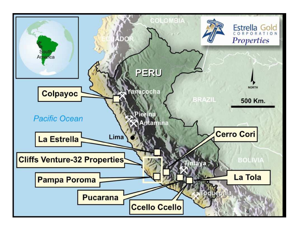
Estrella Gold's Projects in Peru

Projects currently available for joint venture include: