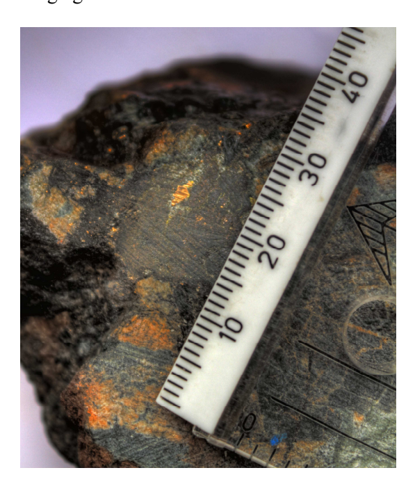
High Grade Gold and Uraninite Sample from Rompas

Bonanza grade gold and uranium mineralization has been discovered at Rompas in nearly 300 outcrop and subcrop occurrences over a large area exceeding six km in strike and 200 m in width that is mostly covered by glacial deposits. Grab samples have run up to 373 ounces per ton gold and 43.6% uranium. Here's a photo of one of these high grade rocks: