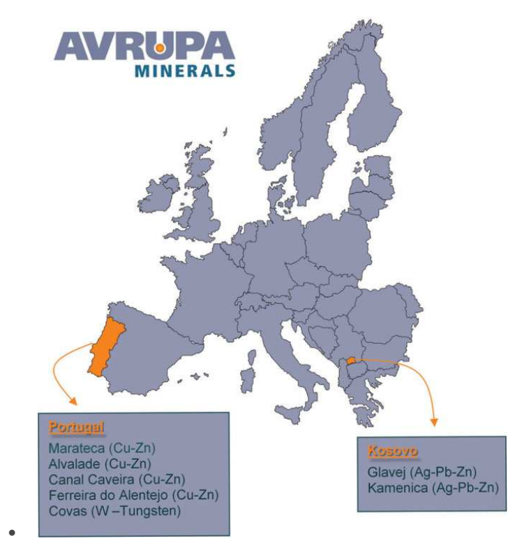
Avrupa Minerals Ltd Projects in Portugal and Kosovo

• Lead, zinc, silver, copper, and gold in Kosovo at the Glavej , Kamenica , Bajgora , and Rezhanc properties in the Trepca Mineral Belt , historically Europe's most productive district for lead and zinc.