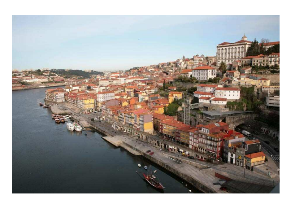
Porto's Famous Ribeira District

The next morning Paul, Adrianno, Brent, and I drove south on European Union-subsidized four-lane highways and wind turbines located in farm and ranch lands.