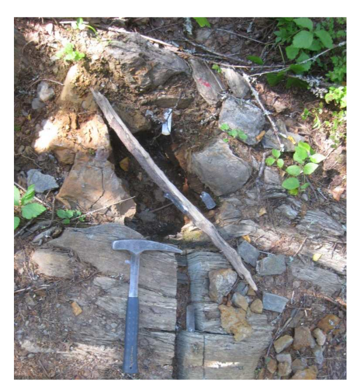
Alteration and Gold-Uranium Mineralization at South Rompas

A high-grade prospect at South Rompas with gold-uranium mineralization in iron oxide and carbonate alteration and hosted by calc-silicate skarn is shown below: