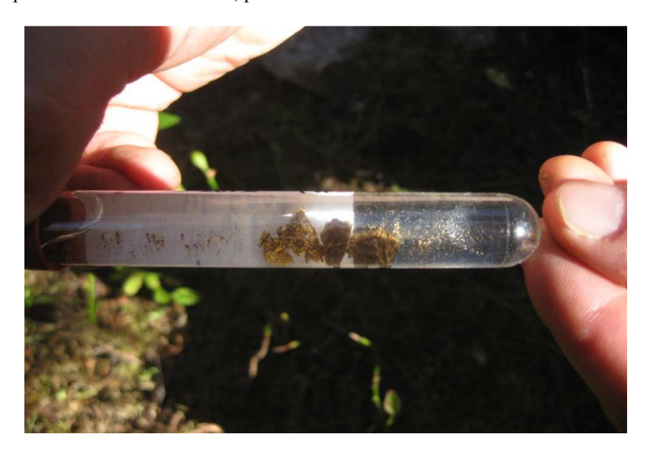
Coarse Crystalline Gold from Rajapalot

And this is the product of Tuomas' efforts, panned from material in the hole: