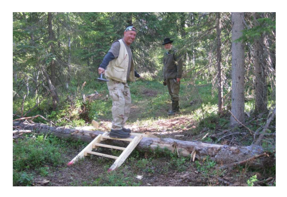
Infrastructure for Investors and Analysts

A high-grade prospect at South Rompas with gold-uranium mineralization in iron oxide and carbonate alteration and hosted by calc-silicate skarn is shown below: