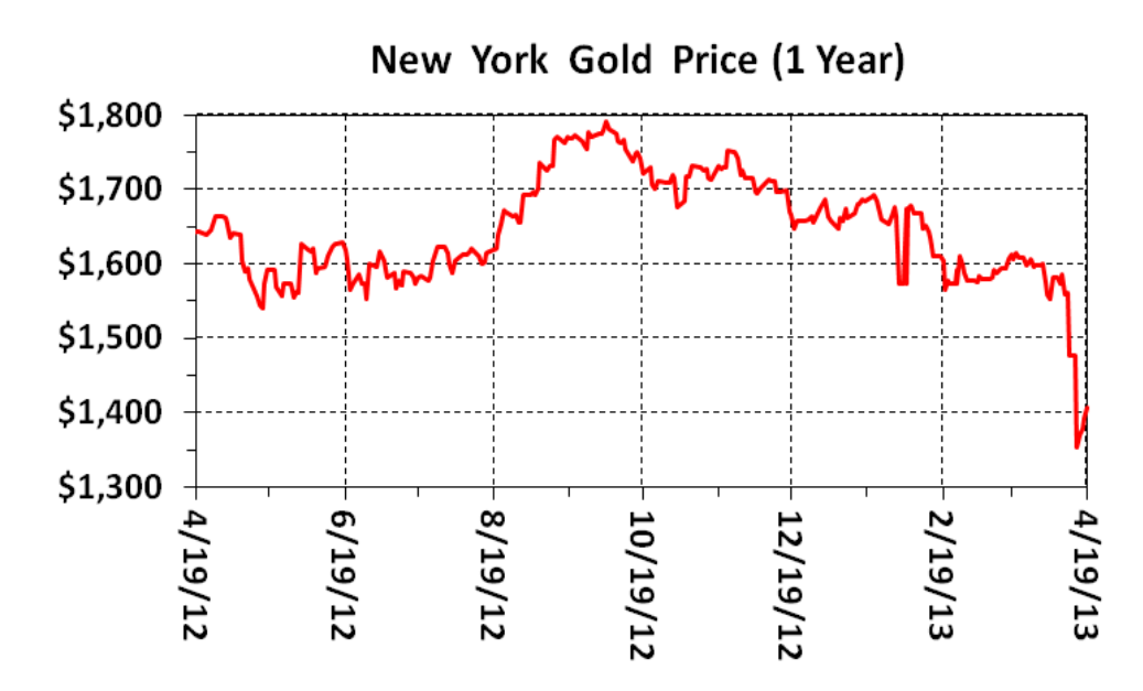
Finally, the two-year chart shows a range-bound price from $1480 to $1550 for the initial two months. This was followed by gold's break-out and exponential rise during the mid to late summer of 2011. It reached all-time highs of $1895 at London close and $1911 during New York intraday on September 5, 2011.

This phase of the gold bull market was driven by anticipation and announcement of a second round of quantitative easing (QE2) by the US Federal Reserve. Extreme volatility carried on thru the winter and early spring of 2012 with four significant market corrections and repeated bounces off the $1480 and then $1550 levels: