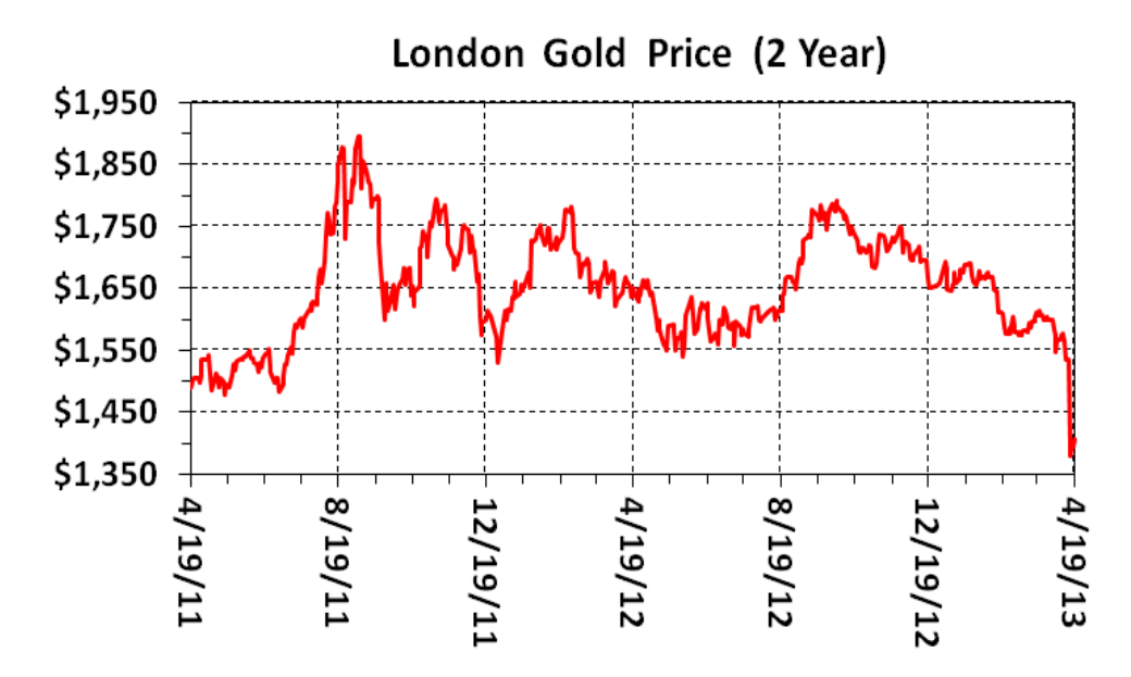
There can be no argument that gold capitulated on Friday April 12 and Monday April 15; the technical damage to its chart is obvious. Several factors during the second week of April resulted in a confluence of catalysts that combined to push gold's downward momentum below its previous two-year lows in the $1480s in mid-April, mid-May, and early July of 2011. They included:

This phase of the gold bull market was driven by anticipation and announcement of a second round of quantitative easing (QE2) by the US Federal Reserve. Extreme volatility carried on thru the winter and early spring of 2012 with four significant market corrections and repeated bounces off the $1480 and then $1550 levels: