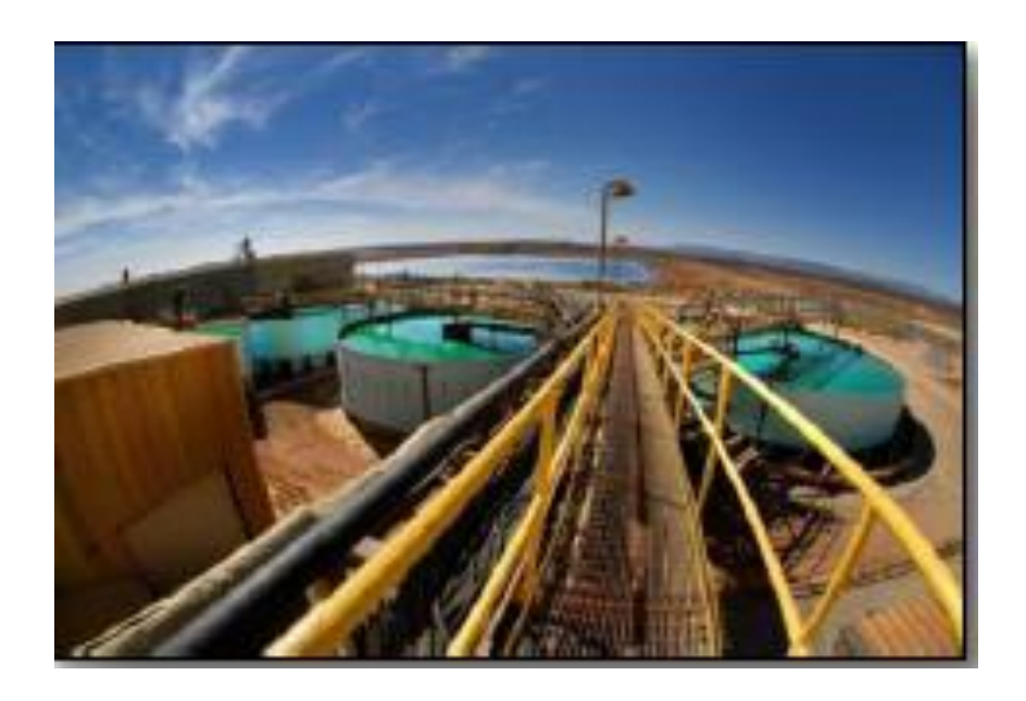
White Mesa Mill, Blanding, Utah

Energy Fuels' foremost asset is the White Mesa mill. It is the only fully-licensed and operating conventional uranium mill in the United States and therefore, gives the company a virtual monopoly on all domestic conventional mining. The mill has a licensed capacity of 2000 tons per day, and can produce up to eight million pounds of uranium per annum. White Mesa also has a circuit to recover vanadium from Colorado Plateau ores, and importantly, North America's only alternate feed circuit to process other uranium-bearing materials. Alternative feeds can include uranium-rich residues derived from UF_6 conversion and uranium-bearing tails from processing at other metal mines.