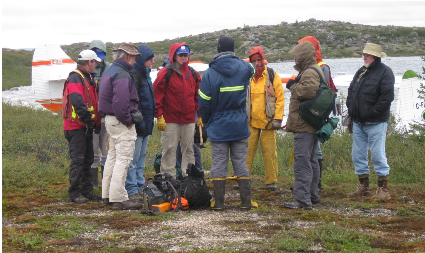
Strange Lake, Quebec, August 2009