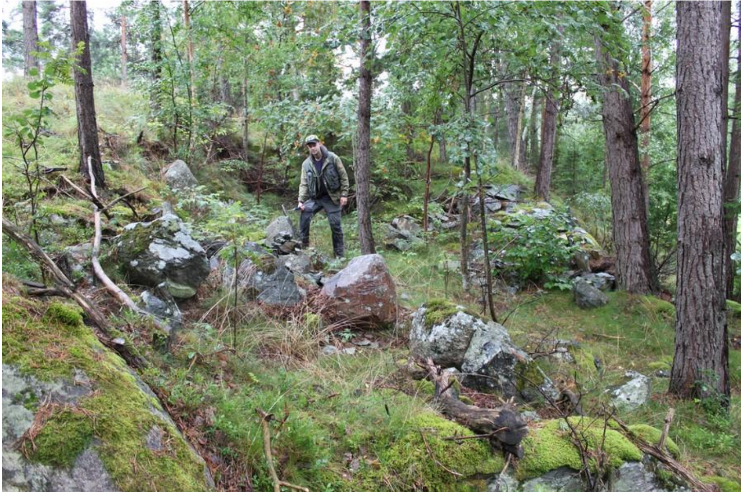
Norra Karr, Sweden