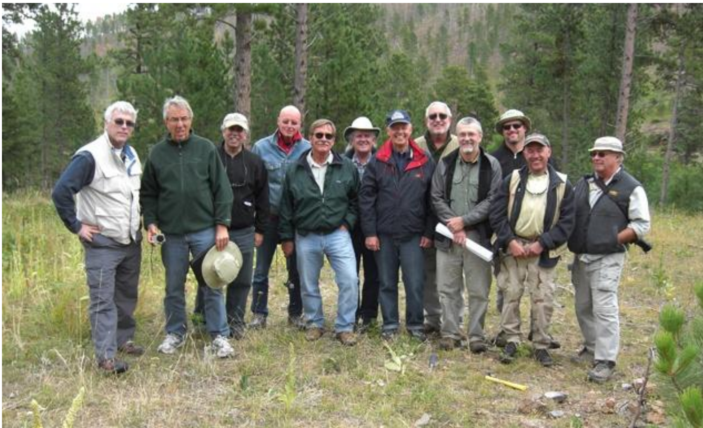
Bear Lodge Mountains, Wyoming September 2008